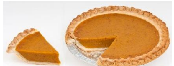
A partial is just a slice of the note pie

If you are thinking of selling your mortgage note, we strongly recommend you consider a partial note sale. A partial note sale will allow you to choose the number of monthly payments to sell, and you will retain the remaining payments.