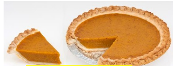
A partial is just a slice of the note pie

If you are thinking of selling your mortgage note, we strongly recommend you consider a partial note sale. A partial note sale will allow you to choose the number of monthly payments to sell, and you will retain the remaining payments for the future.